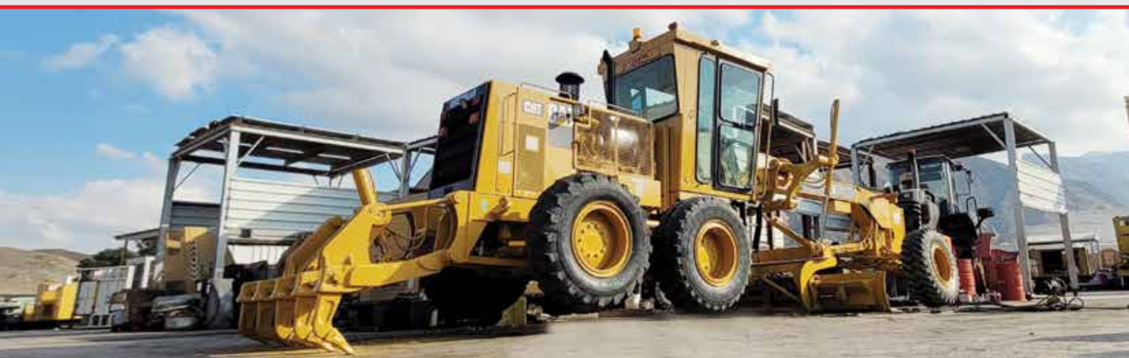
11,000 Square Meter Facility